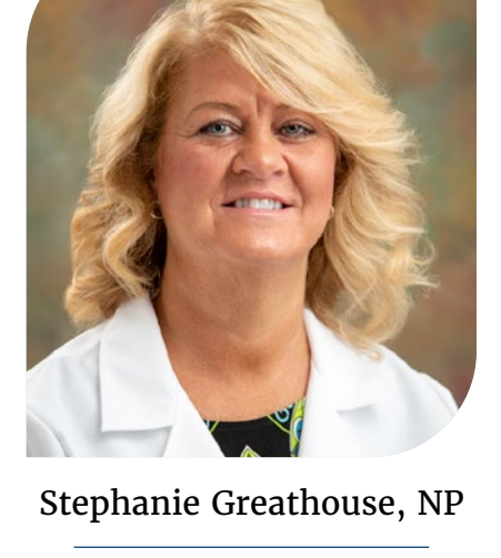
ONCOLOGY CARILION CLINIC